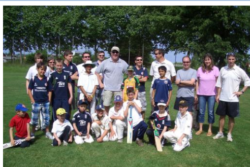
First cricket training at Bachgraben on Saturday, 14th May 2011

With Sam then securing the facilities at ISB Aesch for winter training, we had everything