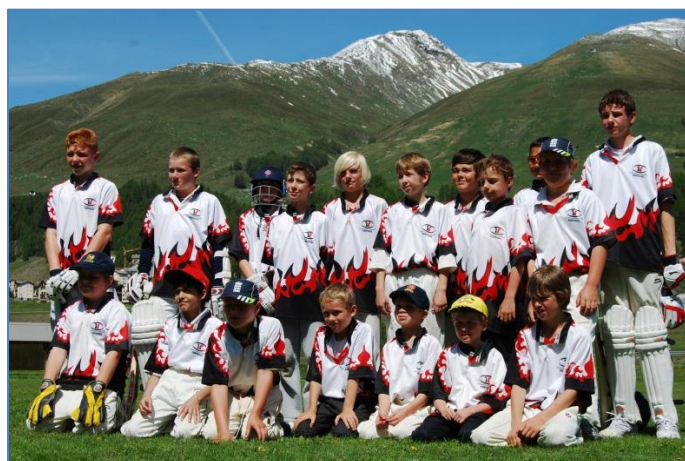
Impressions from Zuoz festival 2011