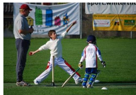
Zurich vs Dragons U11 – Sept 2011